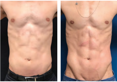
Before and after treatment with Emsculpt

Another way that BTL is leading the charge is with their response to the COVID-19 crisis. BTL has partnered with RealSelf and others to help the industry weather the “new normal” by launching the Sculpt Your Practice online education platform. The focus of this platform is to ensure practice success and provide 24/7 access to knowledge, training and downloadable resources. Featuring virtual demos and webinars on existing and emergent technologies, clinical trial information, best practices, practice management and more in six virtual ‘booths’, makes it the most comprehensive program available.