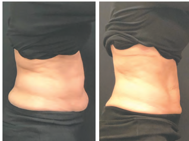
Before and three months after treatment with Emsculpt

And who wouldn’t be interested in non-invasive, exercise-free muscle building that