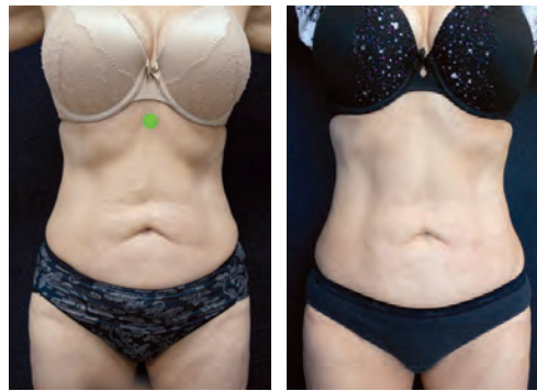
Before and after treatment with Emsculpt

Strength of contractions is related to strength of induced current. While the patient is sitting in the applicator ‘chair’, Emsella delivers up to 2.5 Tesla of magnetic induction at the coil surface. “Pelvic floor muscles are difficult to strengthen, and few people are able to do Kegel exercises properly, so Emsella’s ability to isolate and