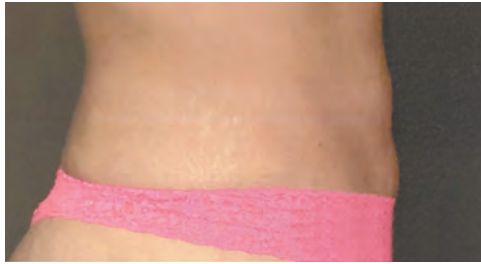
Before and three months after treatment with Emsculpt

“We noticed the visibly elevated mood of our patients after HIFEM treatment. Using a survey with validated Subjective Happiness Scale, 87% of subjects reported happiness after the treatment.”